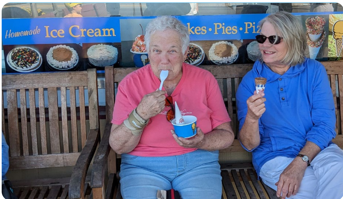
Two Lights State Park Trip: Ice Cream at Beal's

These wonderful events will be hosted at the Gibson Center. Walk-Ins are not permitted, one must register for classes with OLLI.