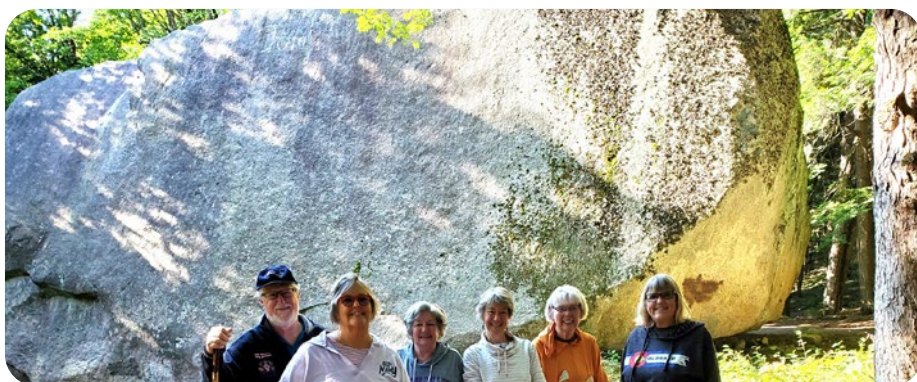
Walking Group at Madison Boulder

Please consider your having sunscreen, bug spray, tick protection, shading hat, hiking pole if you are more comfortable, camera, binoculars if you are a birder, water bottle and sunglasses. Your comfort and safety are always important.